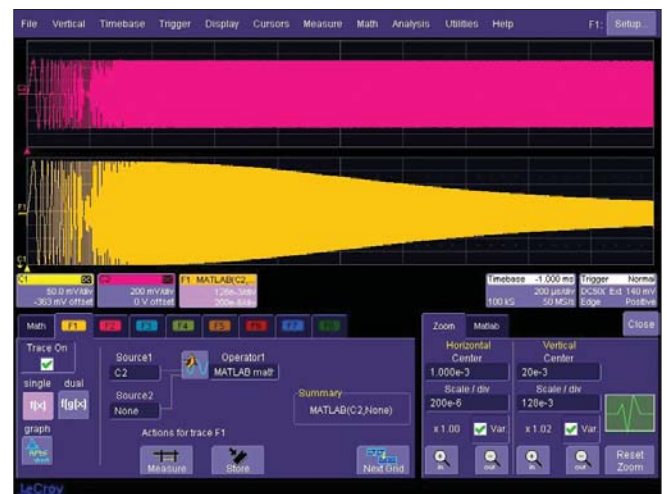
A user-created MATLAB low-pass filter is easily inserted as function F1 in the WaveMaster user interface.

Only the WaveMaster DSO provides the ability to create your own parameter measurements or math functions in the scope's user interface. Unique or proprietary MATLAB, Mathcad, VBScript, or even Excel calculations can be simply selected like any other LeCroy-installed parameter or math function, and the results displayed on the scope screen. It's that easy! Since the resulting waveform is inserted back into the X-Stream processing flow, cursors, measurements, and math can be performed on it, giving much more power and flexibility than a simple export of data to a third party program. LeCroy's advanced features also provide the ability to program the scope using ActiveX Automation language, embedded scripts, and other open Windows features, to create a scope that meets your specific needs. Why accept only connectivity when you can have true customization?