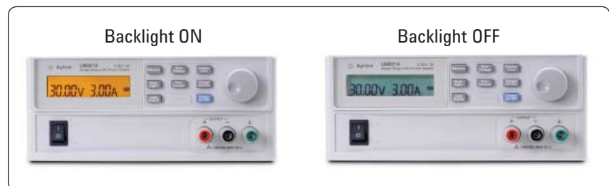
Figure 2. Backlight on/off options for LCD display