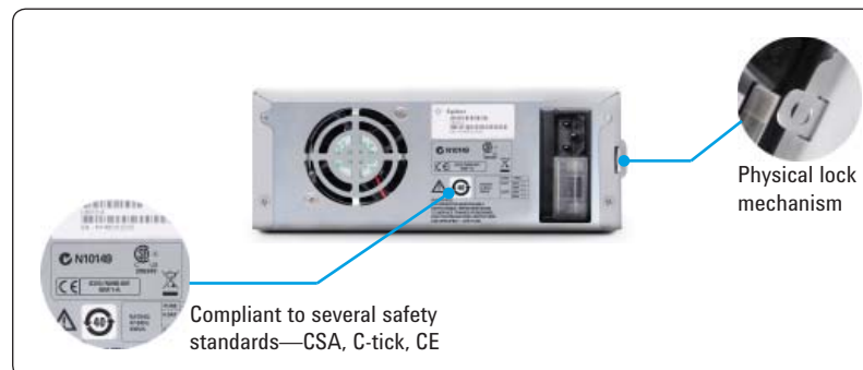
Figure 3. Safety and security features of the U8000 Series single output DC power supplies