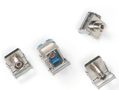
Optical adapters (BN 2150) for signal input