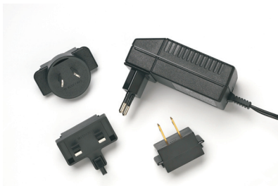
Worldwide compatible AC adapter/charger (SNT-121A)